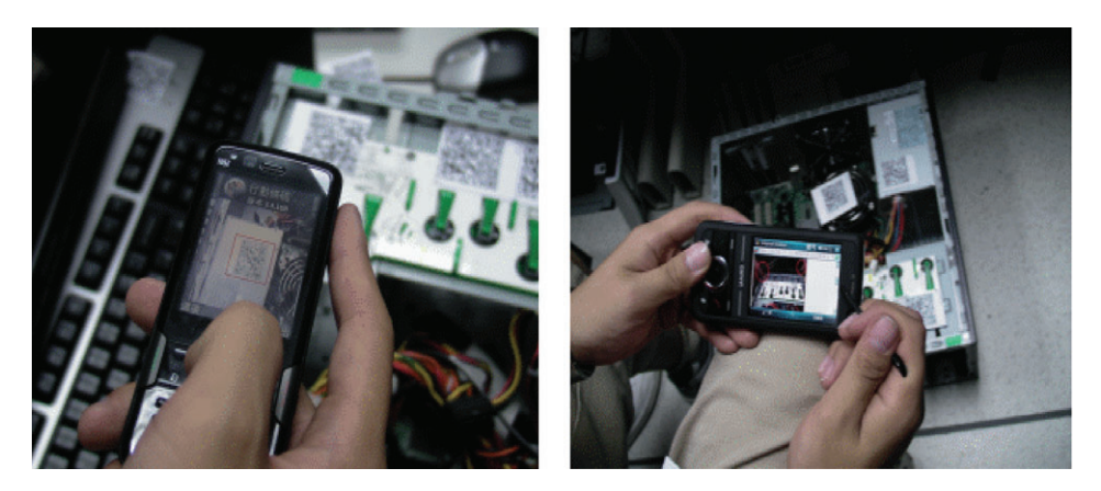
Figure 2: Learning scenarios of the PC-DIY (Personal Computer- Do It by Yourself) ubiquitous learning activity